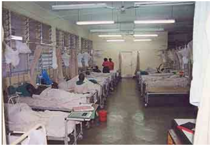
Urology ward, KCMC

In the next theatre, Chris Chapple had the "redo urethroplasty from hell" on a 15year-old youth. He undertook a bilateral penile skin island flap primary repair after excising nearly 6 cm of severely fibrotic tissue. This was followed by a short "sweet tea" break and then further complicated urethral stricture and hypospadias surgery. Most cases were completed as one-stage procedures. All surgeons were happy to answer questions from the viewing doctors and photographs were taken as needed.