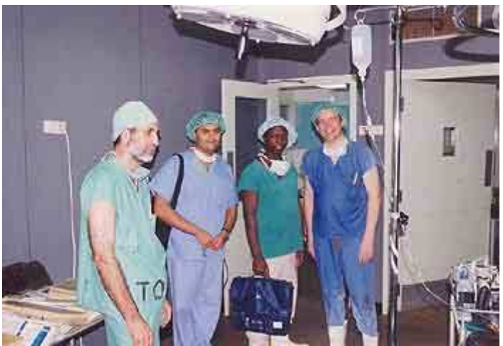
After 4 hours in a steamy theatre - still smiling!

Theatre sessions usually ended at about 3pm with a brief lunch break.