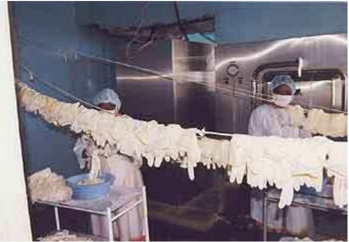
Reused gloves - washed and being sterilised

Re-use of disposables including gloves and catheters